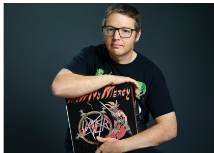
Nickbomb: 4/13/2013 Driftless Doom Saturdays at 10pm