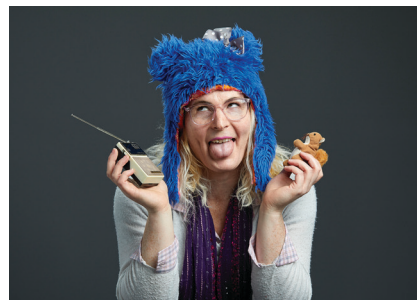
Murder Kween: 6/6/2021 Attack Sustain Decay Release Saturdays at 12am